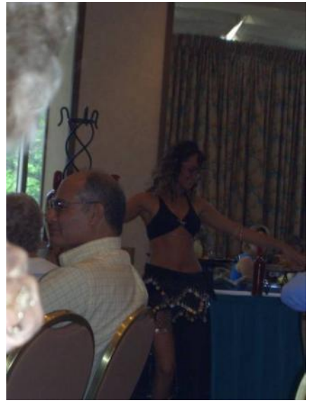
Belly dancer at Tripoli Reunion 2005.

Tripoli Reunion P.O. Box 180951 Austin, TX 78718-0951