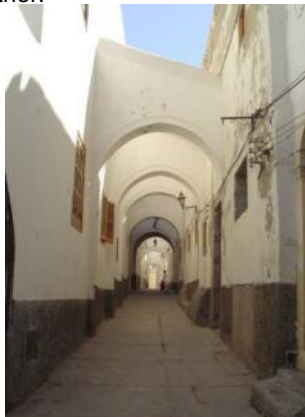
Old City.