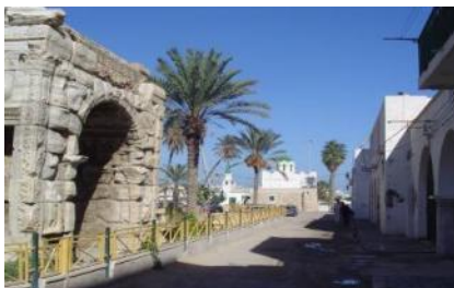
The Arch of Marcus Aurelius.

As one can see by the attached Schedule of Events, the reunion format is the same. Thursday there are no scheduled reunion events other than going to the bar and visiting with the early attendee arrivals. Friday there are no scheduled events during the day, but those groups of friends and/or family that arrive early may want to arrange golf at one of the many beautiful courses not far from the hotel (hint, play early because July afternoons are hot). And despite what some folks say about Houston, there are many incredible museums and sites and shopping (for those that are