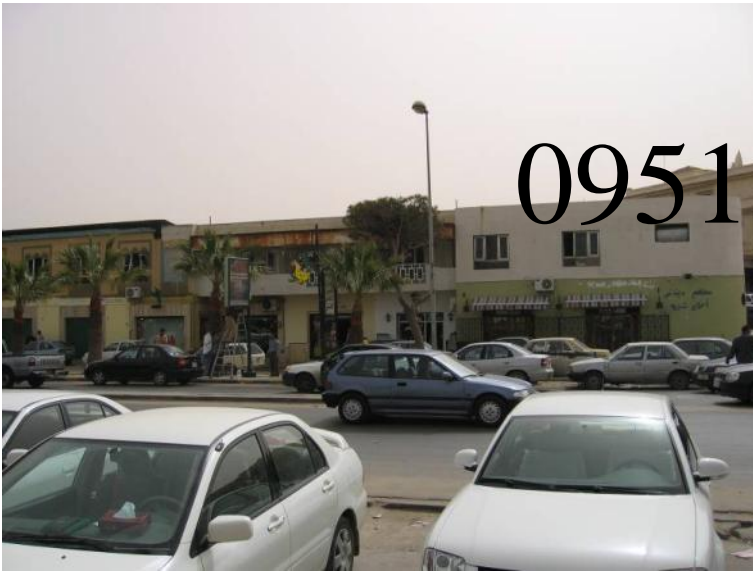
The Chicken on Wheels.