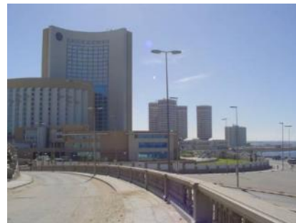
The Corantia Hotel.