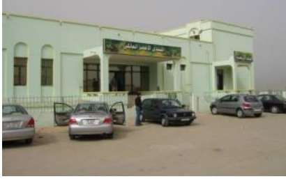
The Bowling Alley.

from shopping challenged locals) that would easily fill a Friday agenda. Friday evening there is registration and/or one may pick up their registration badge.